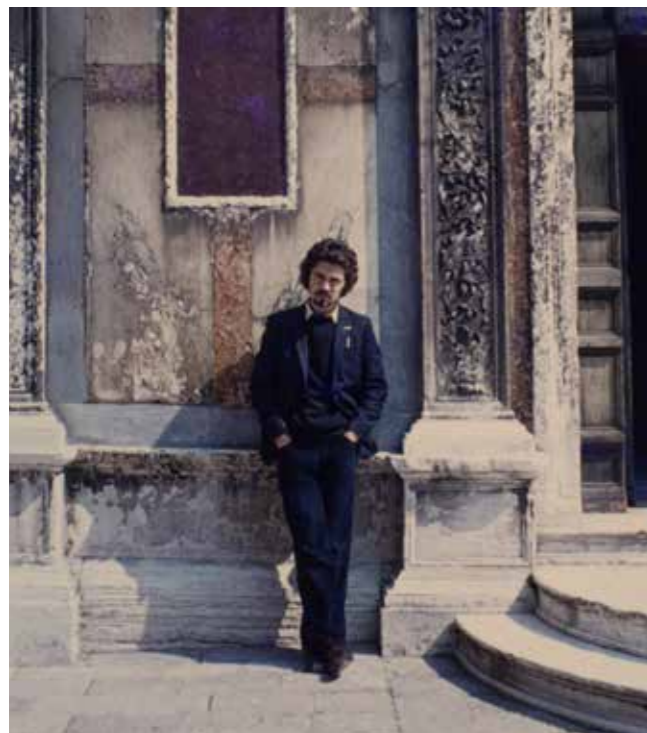
In Venice, 1976