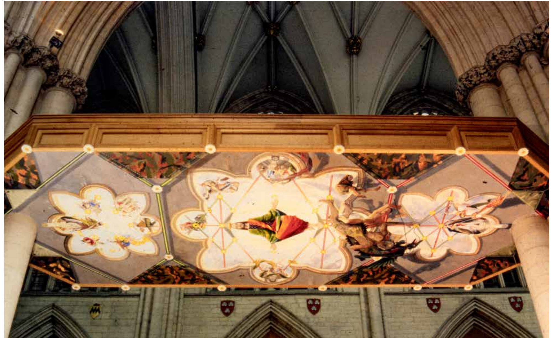
Left, detail of 'Madonna and Child', St Paul's Church, Thame-smead, London, 1984. Above, 'Christ in Majesty with St. Cuthbert and St. George', ceiling panel, York Minster, 1982. Right, 'Three Saints', York Minster, 1980.

‘the work must evolve organically from the site, and reflect something of the interior or architectural dynamics.’