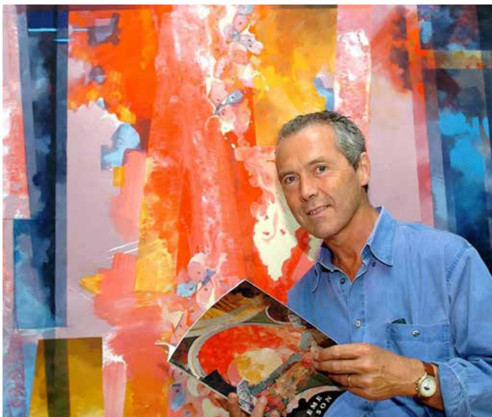
With 'The Heart has its Reasons'