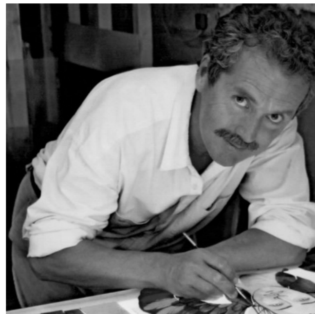
In the stained glass studio