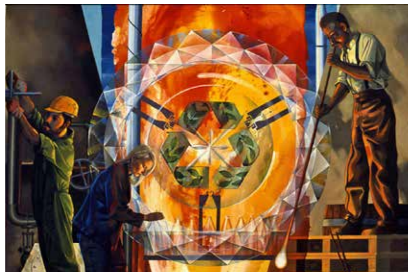
Above, 'The Four Seasons', Morrison's, Darlington, 1996. Middle, Morrison's, Jarrow, 2001. Below, 'The Four Elements', Morrison's, Knottingley, 2004.