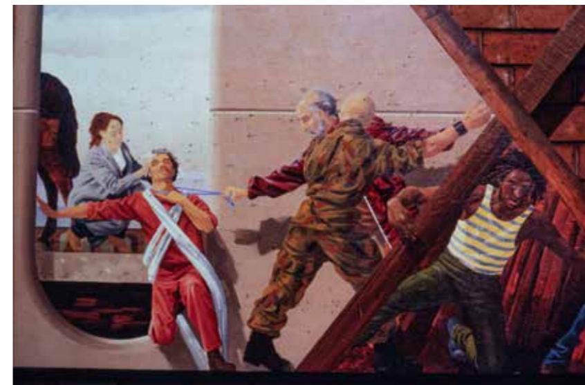
Above, 'Madonna of the Moors', St Margaret's Church, Ilkley 2004. Below 'The 14 Stations of the Cross', detail, St Elisabeth's Church, Reddish, 1983.

At Halifax Minster, the designs included stained glass, the design of an altar table, and the clergy vestments.