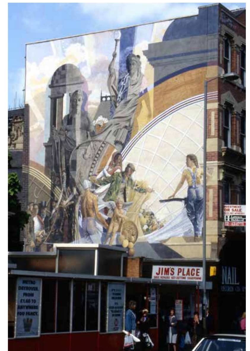
Above left, detail from ‘Inner City Redevelopment’, Cookridge St, Leeds, 1980. Above, ‘Passengers’, Surbiton Station, collaboration with Sue Ridge, 1985. ‘Cornucopia’, Corn Exchange Area, 1990.