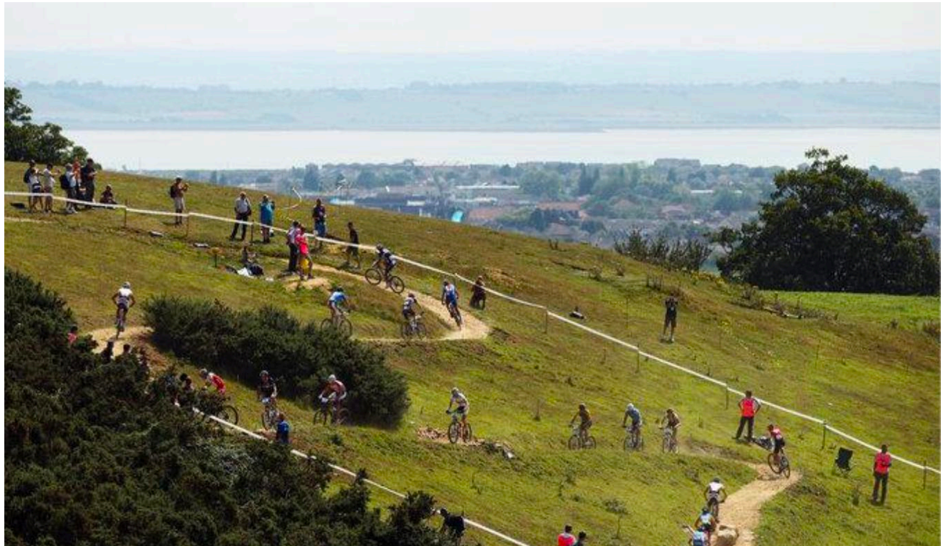
The London 2012 Olympic Mountain bike events in action Where the brick fields once were