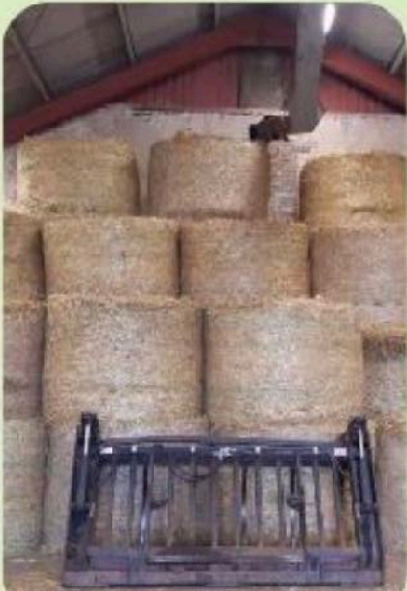
Harvest time with machinery