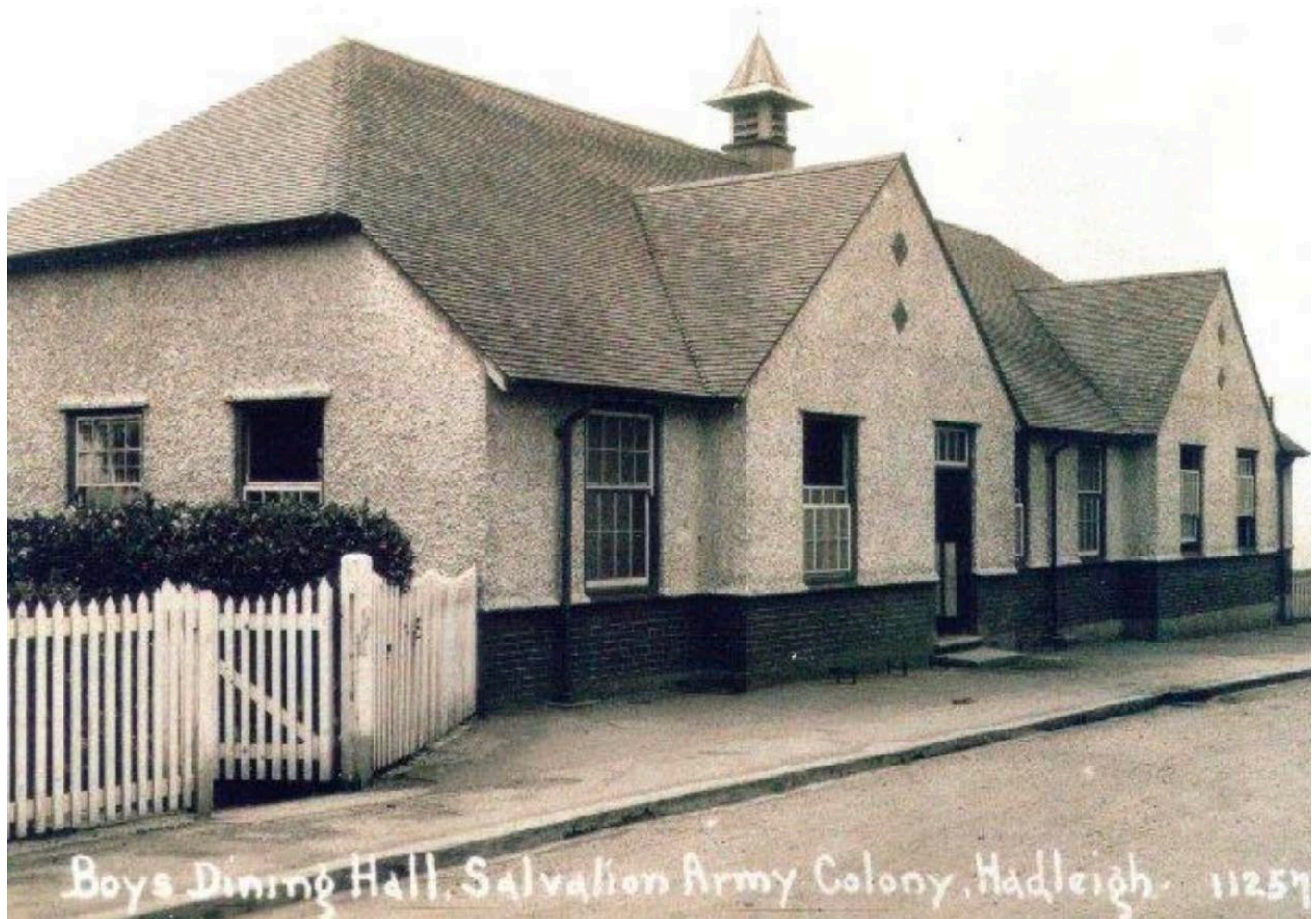
Boys dining hall, originally