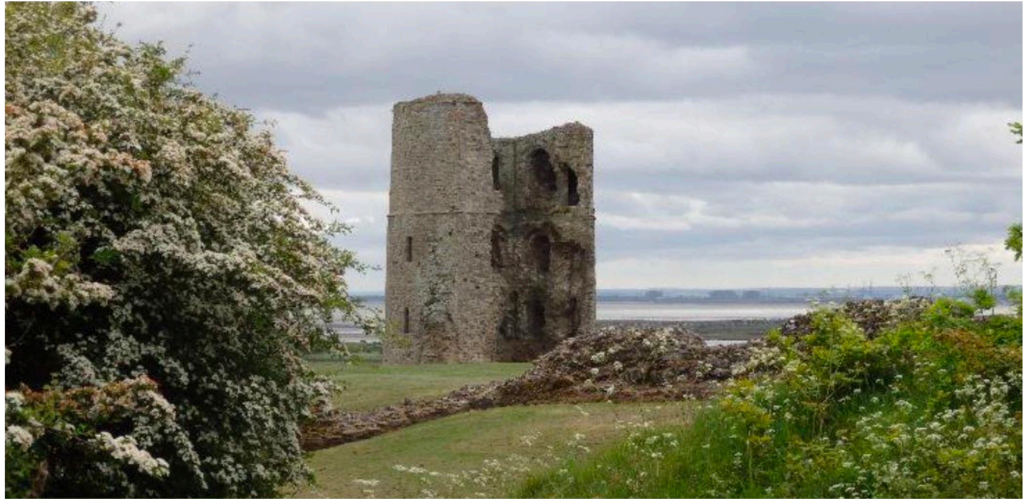
Hadleigh Castle - heart of the park