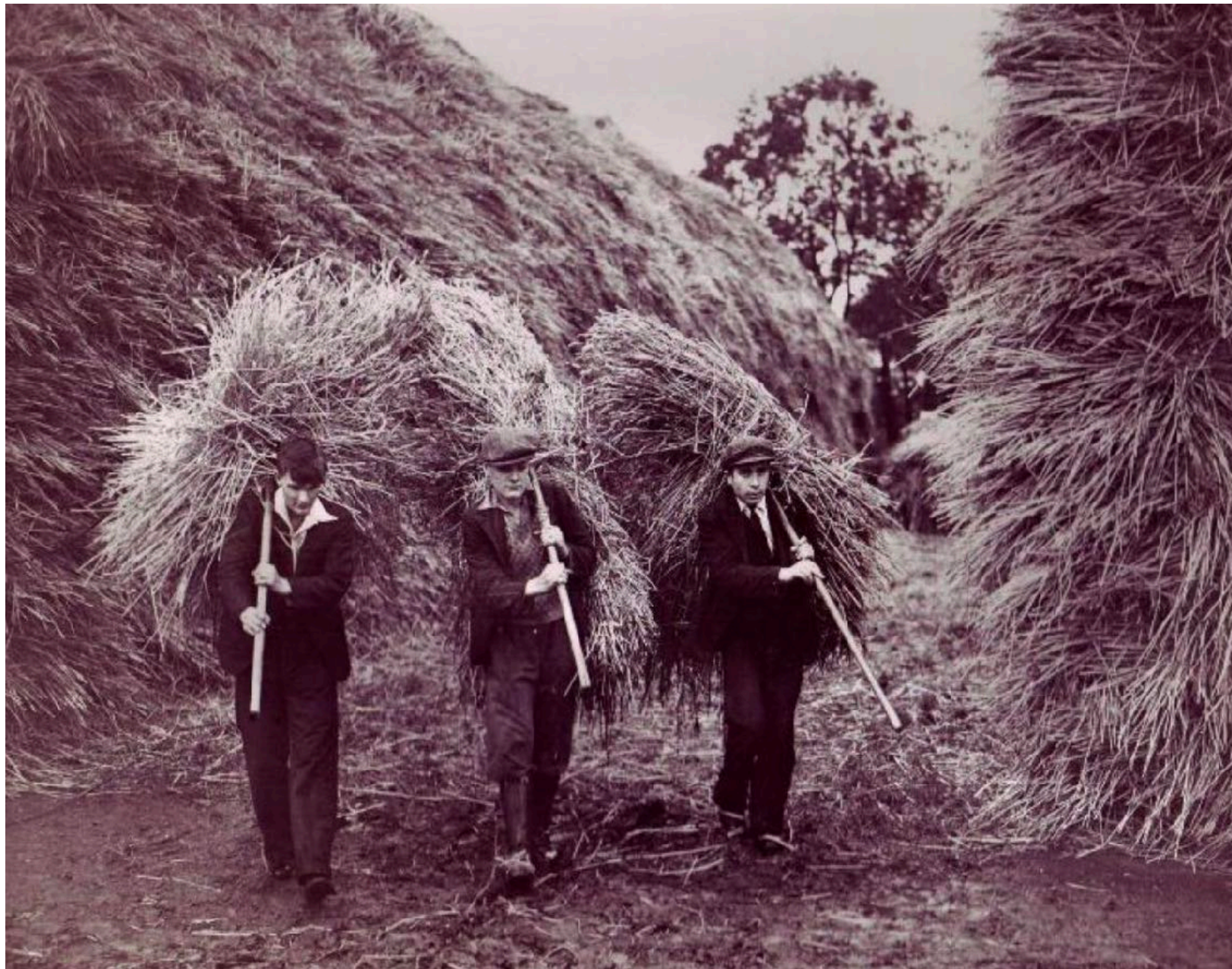
Harvest time and healthy work