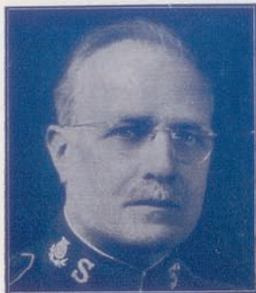
THE CHIEF OF THE STAFF