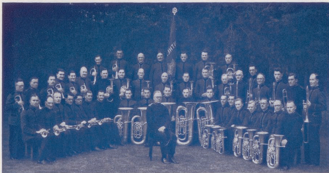
SOUTHEND CITADEL BAND